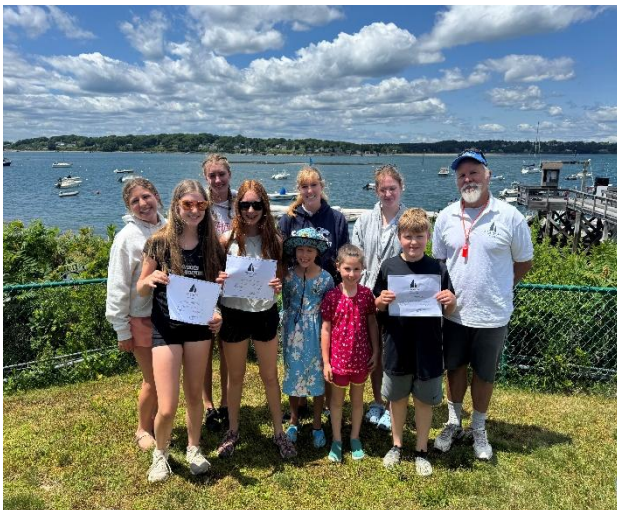
Beginner Students – Week #1