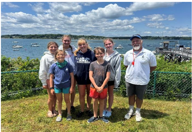
Intermediate Students – Week #1

Our morning Beginner class had mostly girls from the ages of 8-12. We had two younger “true beginners” who underwent exponential growth. Some of the more challenging experiences was getting out “of irons” or being stuck with bow facing into the wind with luffing sails. One student referred to the sails as laughing, not luffing. We had a good mix of weather with some light wind sailing, some morning fog and a morning where the wind was well over 15 knots and we spent the day in the classroom and outside doing activities, including a compass course with 4 marks. We mostly sailed in our single crew Opti's but also got the entire class into the Rhodes19 where all students got to steer, handle the mainsheet and the leeward jib sheet.