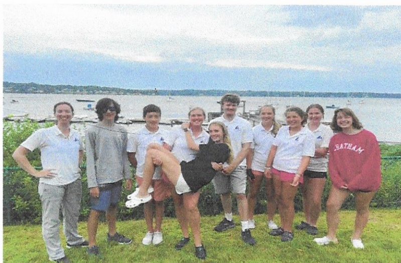
RACING CLASS WEEK #3