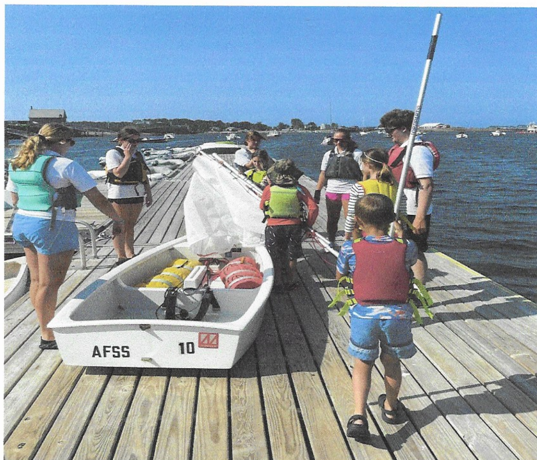
Beginners rigging an Opti