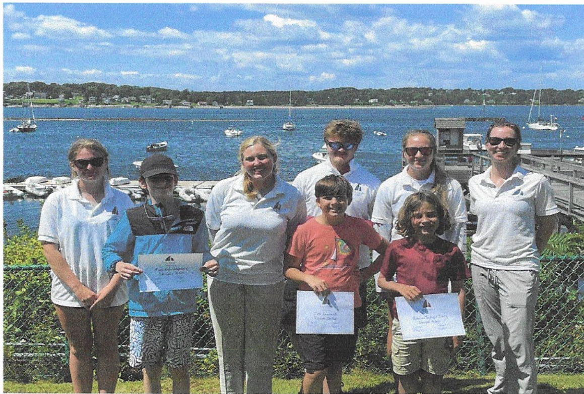
Intermediates – Week #6