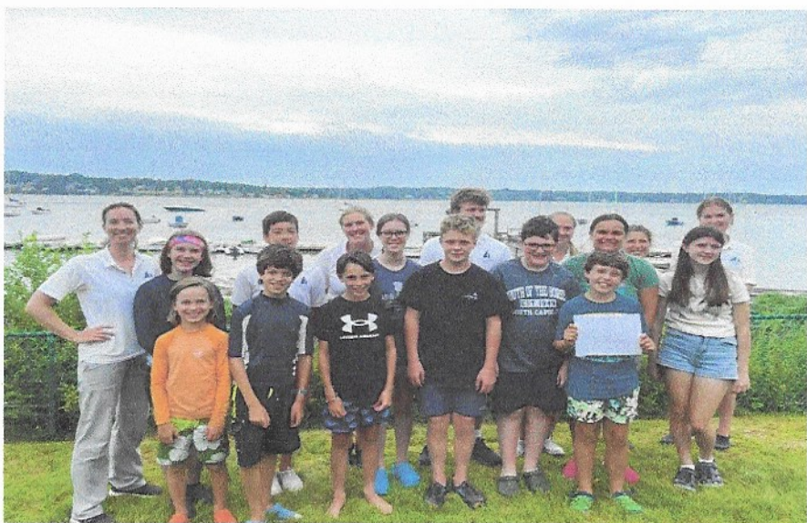
INTERMEDIATE CLASS WEEK #3