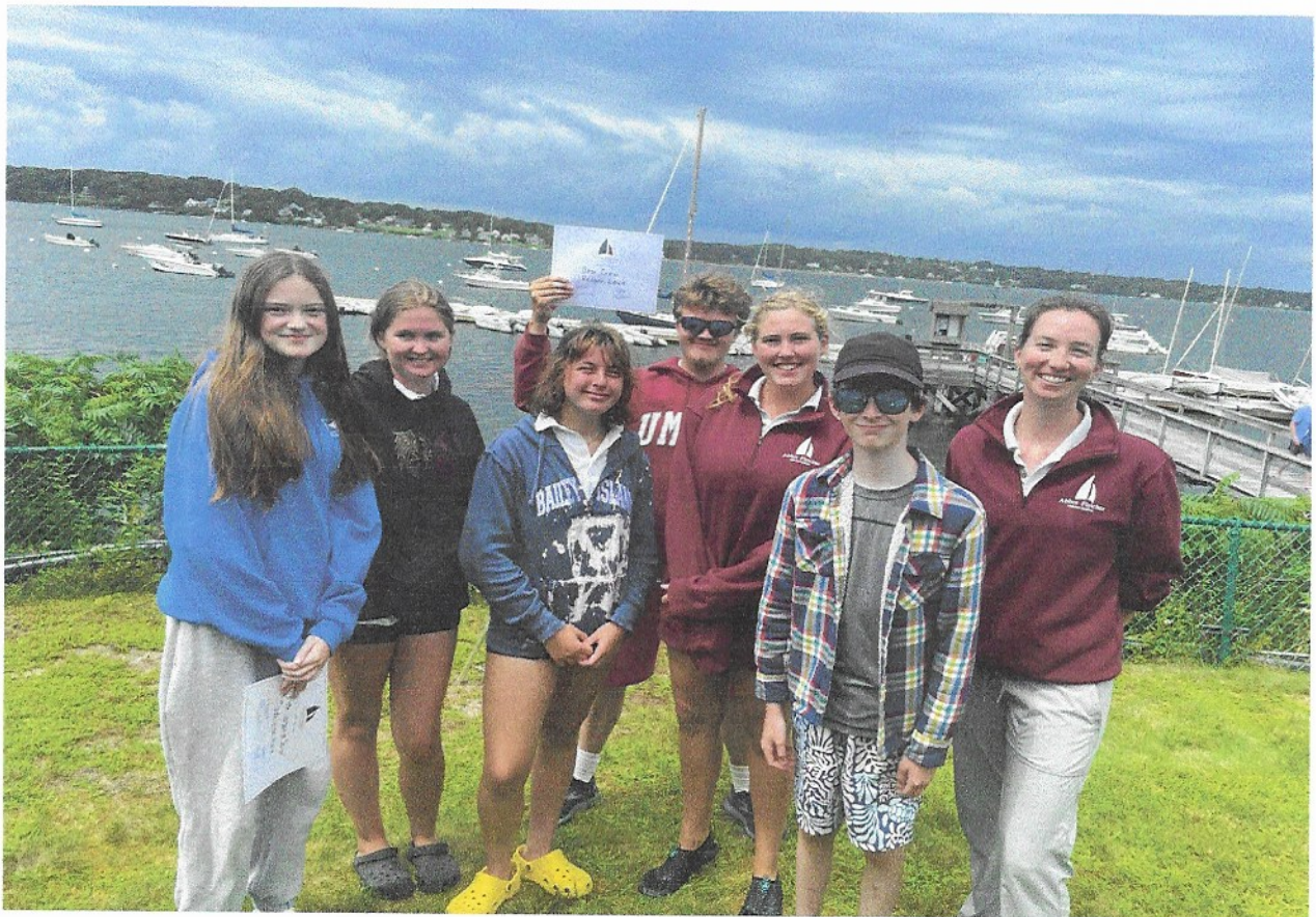
Intermediate Class Week #5