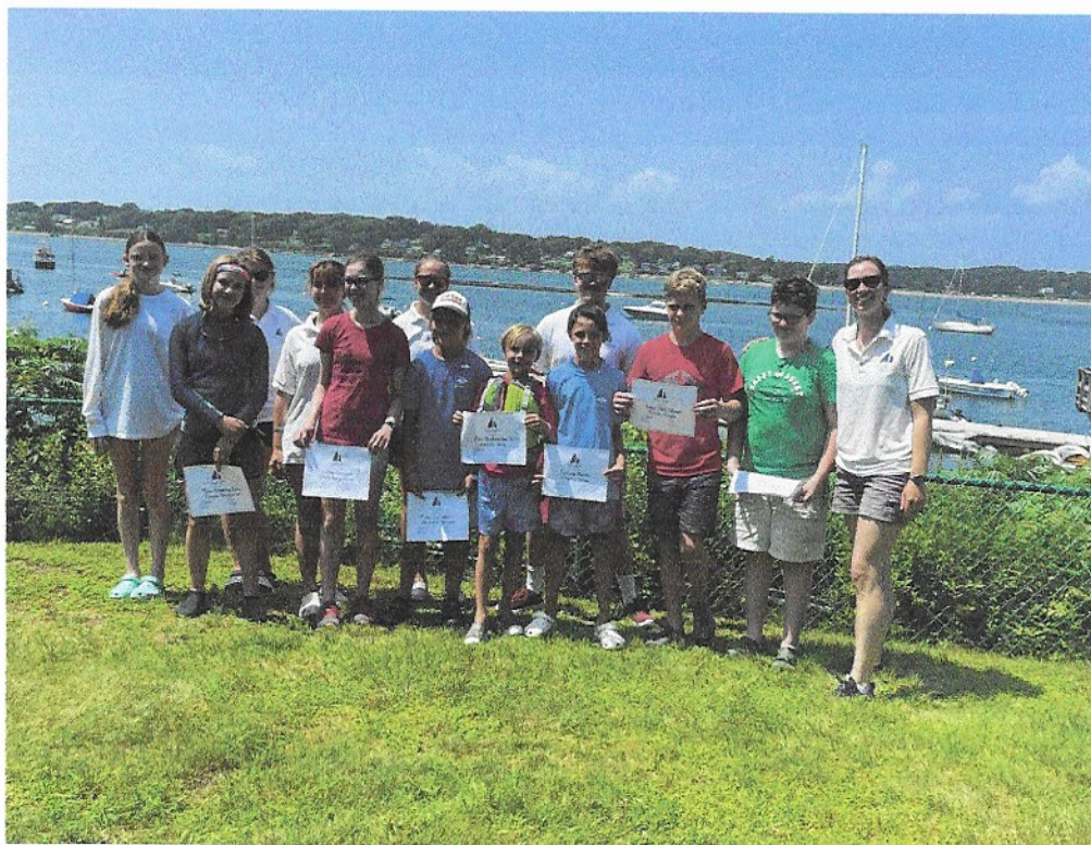
Beginner Class – Week #4