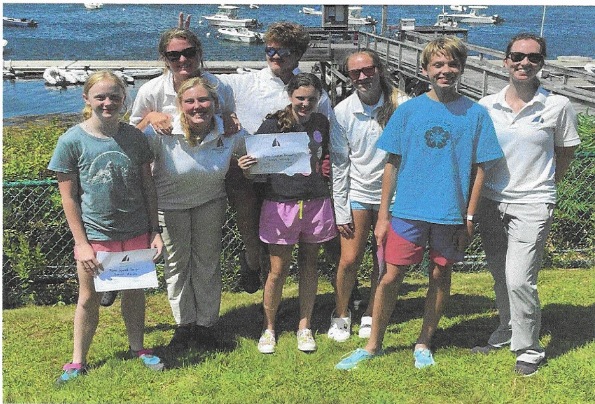
Beginners - Week #6