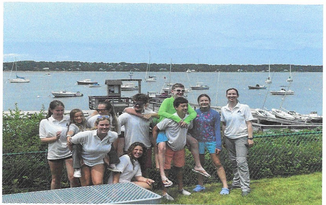
Week #2 Intermediate Class