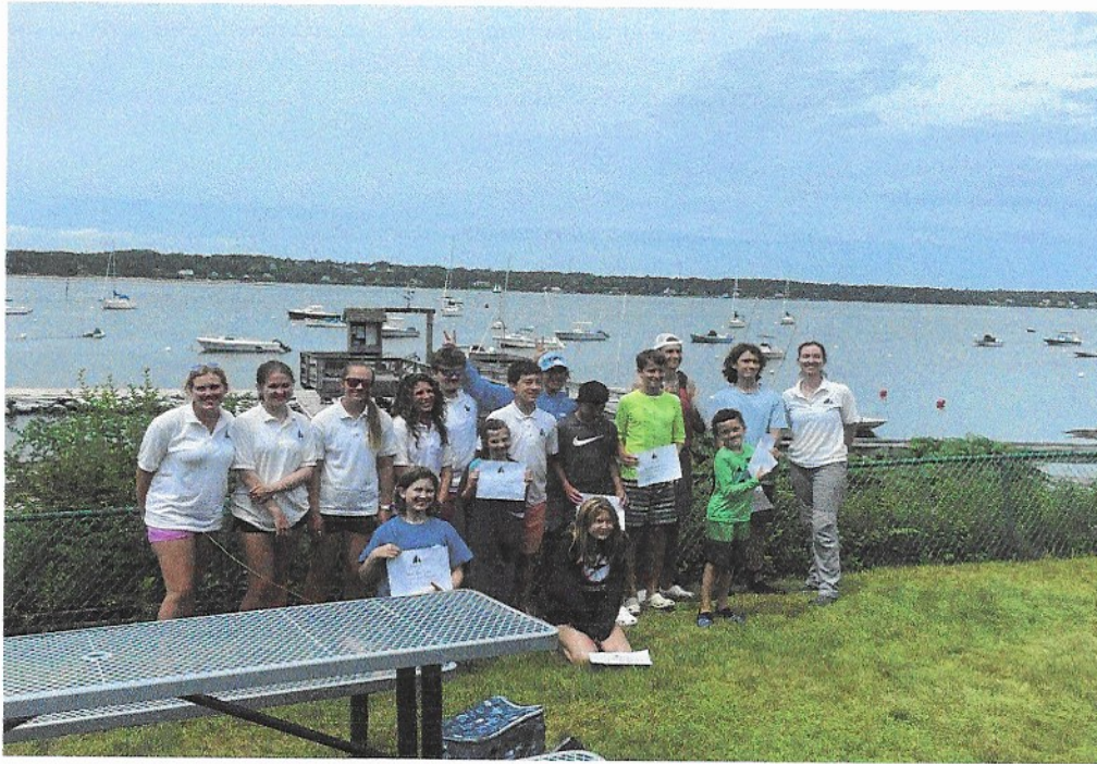
• Week #2 Beginner class