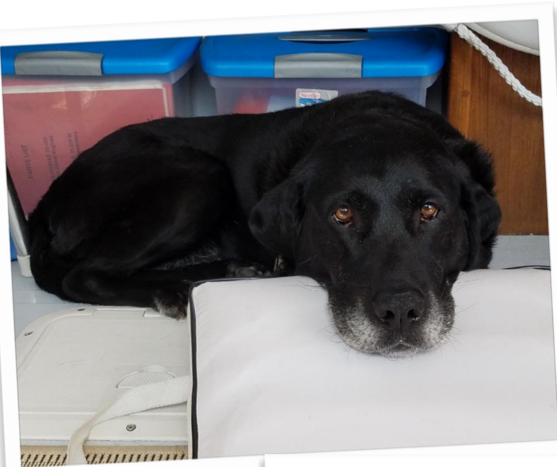
Rich and Bunny Siegel's Lab Callie takes a boat break after resting under a picnic table.