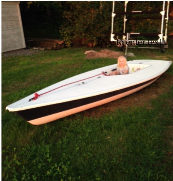
Laser for Sale – needs a little work. Former AFSS boat. Can be seen at OBYC. $1000.00 OBRO.

The club is selling two Laser sailboats that were used in the racing program. See below.