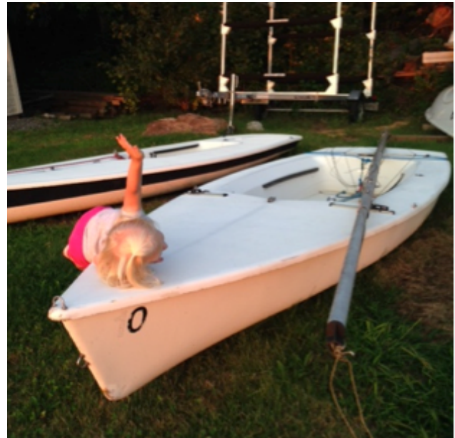
Laser II for Sale – needs a little work. Former AFSS boat. Can be seen at OBYC. $500.

Please contact Malcolm McFarland – (207) 833-6671.