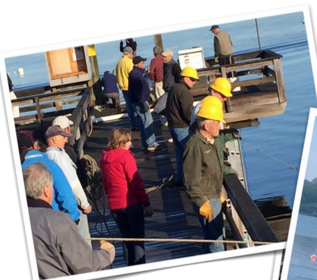
Early risers launching the floats