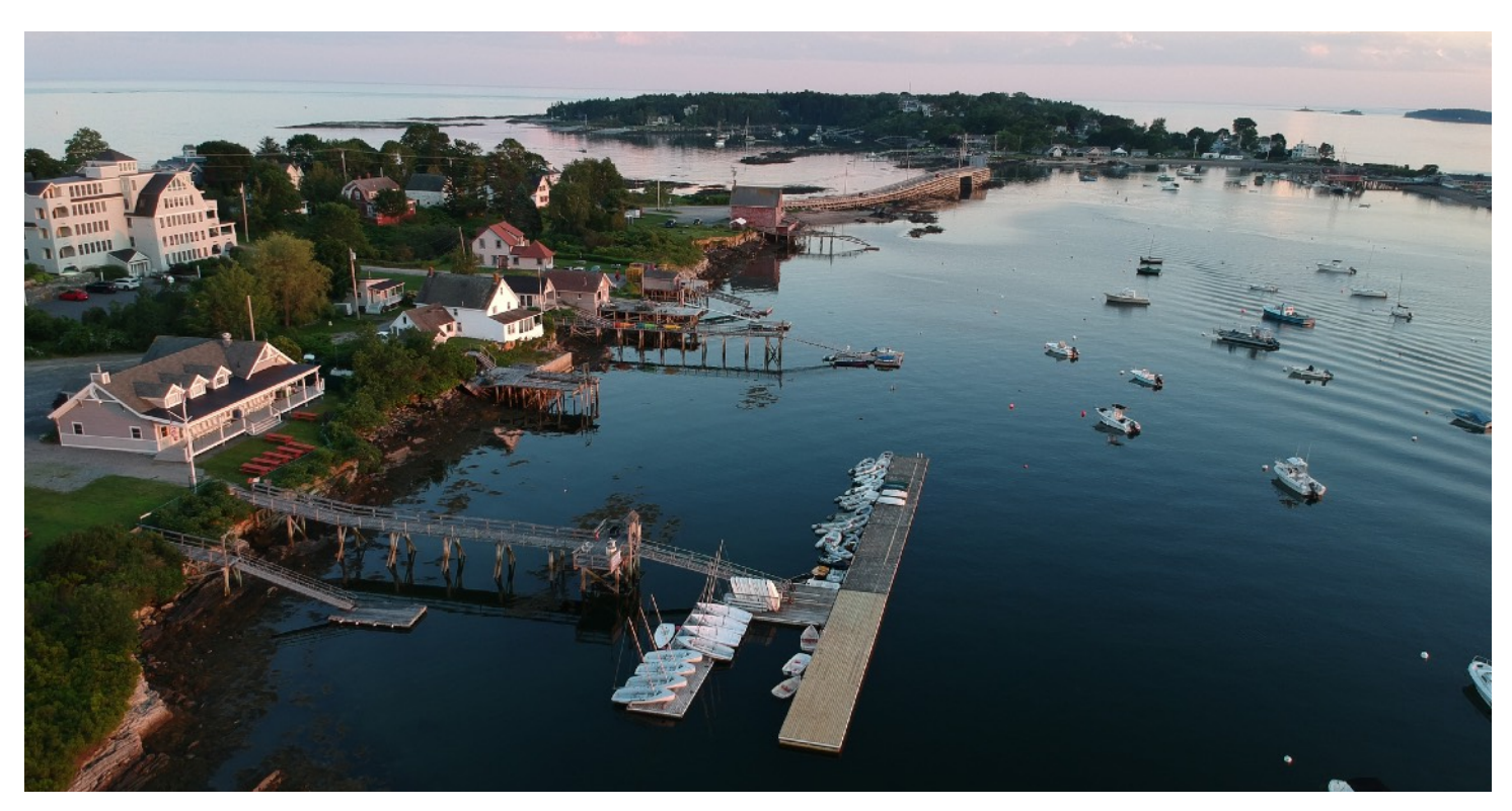
Day's End Drone

volunteer-run since 1955 • www.obyc.org Page 2