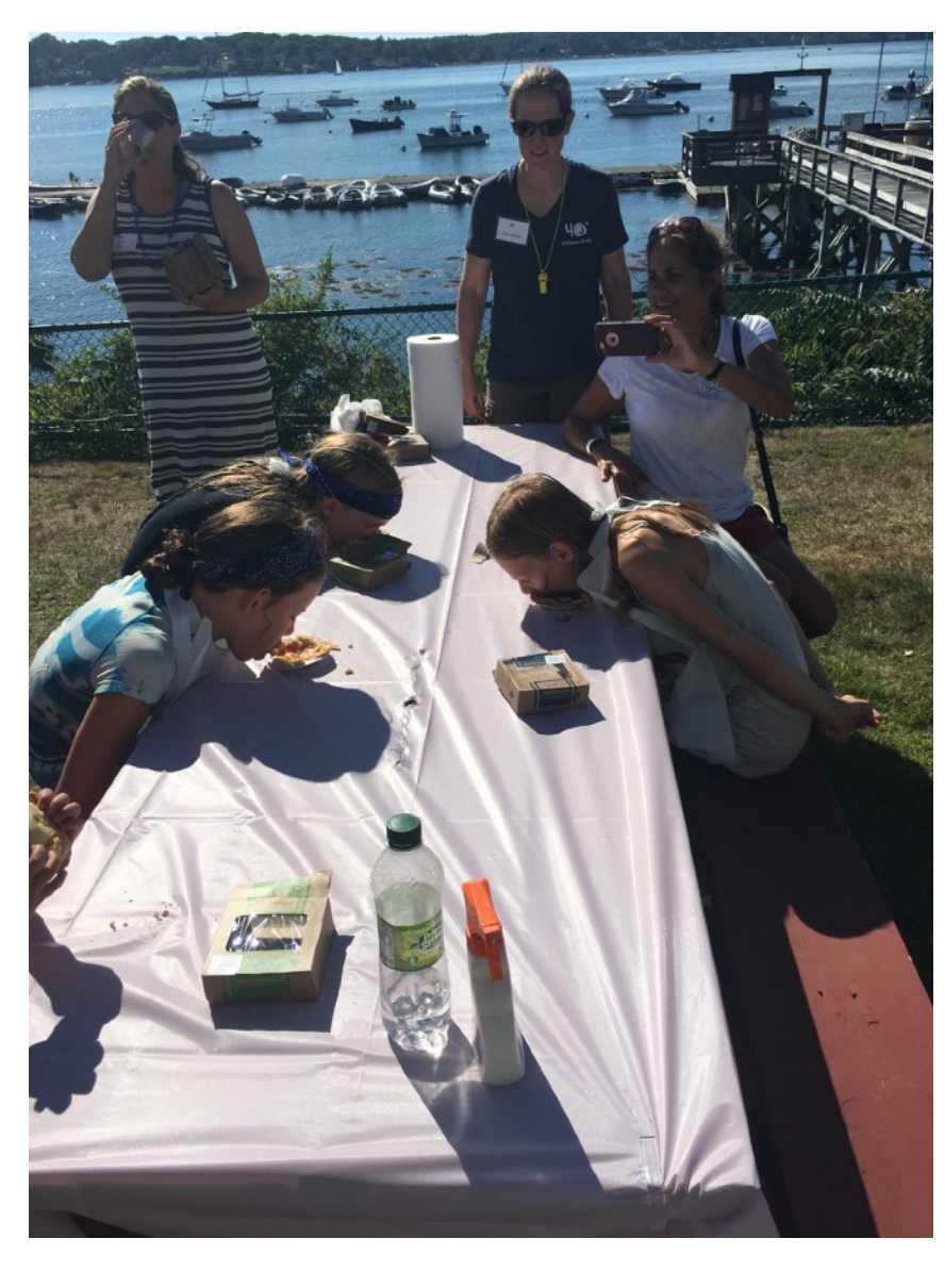
Family Day Pie-Eating Contest