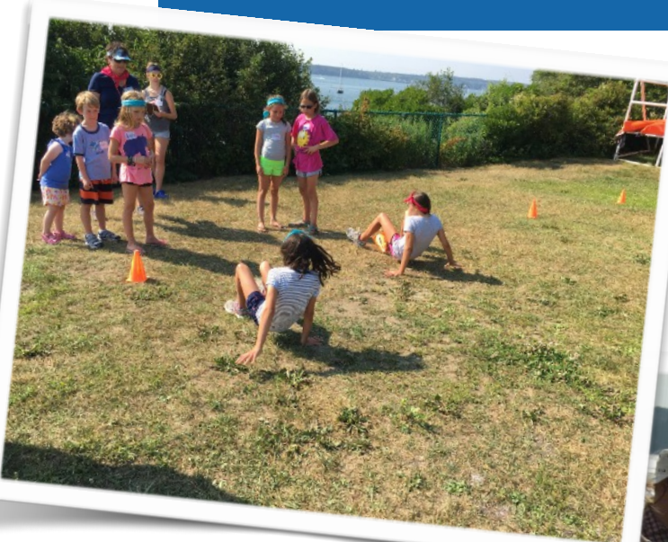
Crab Walk Relay